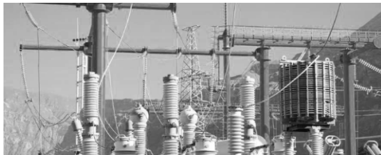
POWER & UTILITIES